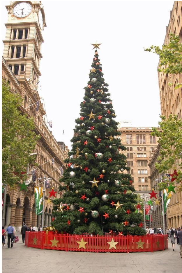
9 - Chrissy - Christmas