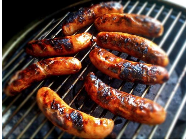
1 - Barbie - barbeque