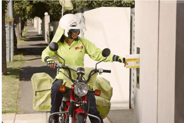
4 - Postie - postman