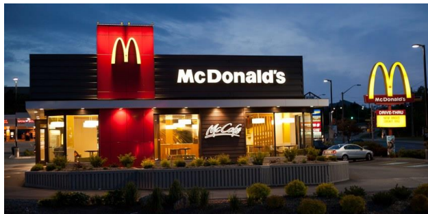
3 - Macca's - McDonald's