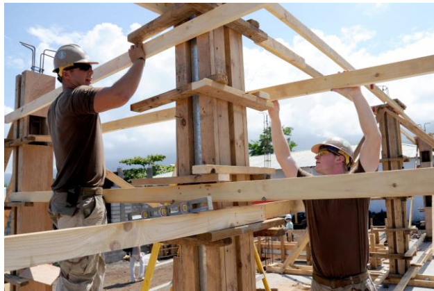
2 - Tradie - tradesman, like a builder or plumber