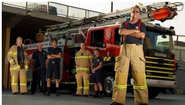
7 - Firey - firefighter