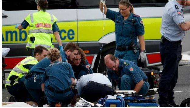
8 - Ambo - ambulance officer or paramedic