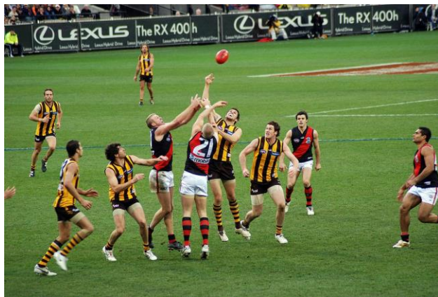
5 - Footy - Aussie Rules or rugby