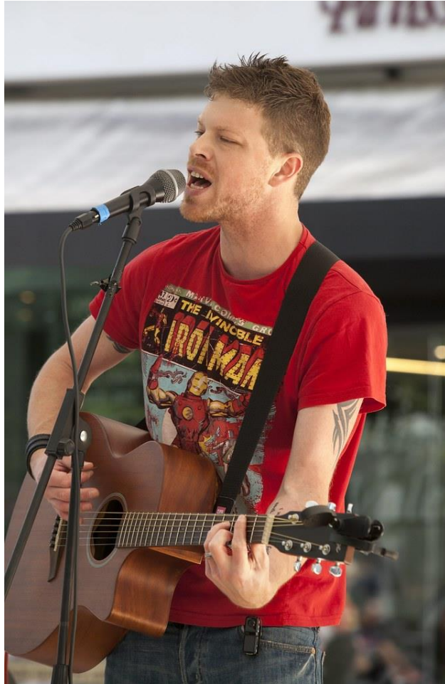
6 - Muso - musician